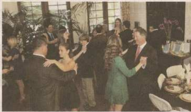
The NCL Father-Daughter Waltz at the Fairbanks Clubhouse